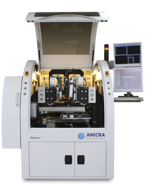
Example of an SMT (Surface Mount Technology) machine

Current innovations in SMT placement technology revolve around: production improvement across the vertical market, feeder technology, flexible and modular gantry systems, improved tracking to enhance first pass yields (FPY), superior factory management systems and inter-machine communication platforms.